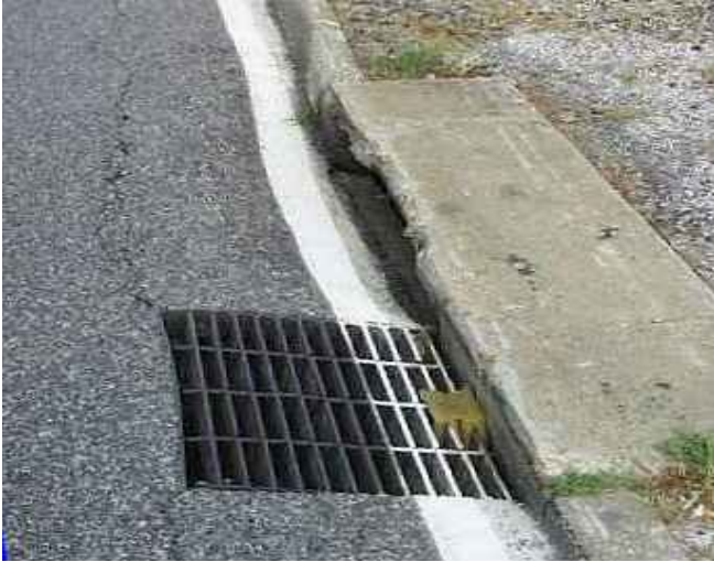
Figure 5. Catch Basin

The two primary species of urban Culex mosquitoes in our area, Cx. pipiens and Cx. restuans , breed in highly organic or polluted water that collect in catch basins, ditches, storm water structures including retention ponds (Figure 6), and discarded tires, clogged gutters, bird baths and other man-made containers (Figures 7-8). Applications to schools must be in compliance with MGL Ch. 85 and 333 CMR 14.08 : PROTECTION OF CHILDREN AND FAMILIES FROM HARMFUL PESTICIDES.