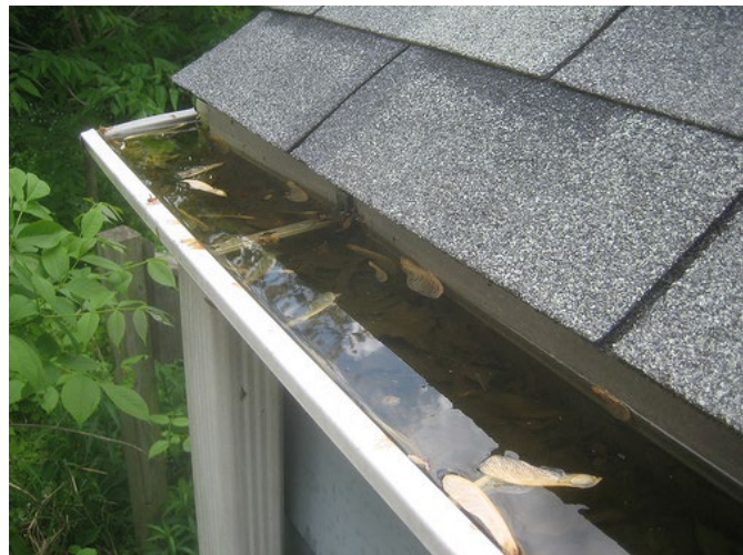
Figure 8. Clogged rain gutter filled with water

Treating catch basins consists of the application of either a bacterial agent or growth regulator. Short term surveillance data showed an 80% reduction in Culex species in communities where basins are treated compared to communities with untreated basins. In a study conducted in Portsmouth, NH in 2007 by Municipal Pest Management Services Inc., there was a 75% reduction in mosquitoes breeding in treated catch basins compared to untreated basins (34). Long term surveillance data has shown that continual annual treatment of basins significantly decreases Culex populations throughout the district.