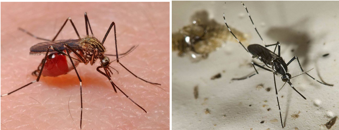
Figure 15. Japanese Rock Pool Mosquito ( Ae. japonicus ) Figure 16. Asian tiger mosquito ( Ae. albopictus )

Another exotic and geographically expanding species are Aedes albopictus , the "Asian Tiger Mosquito" (Figure 16). It is a notorious daytime human-biting species and competent disease vector. We are currently monitoring the progression of this species as it potentially moves into the northeast. Originally from northeast Asia, it has spread rapidly throughout the temperate regions of the world assisted by the importation of used automobile tires and ship hulls. Water-filled discarded tires, flowerpots, and other containers left outdoors is where this species tends to lay its eggs. Like salt marsh mosquitoes near coastal regions, this species will aggressively attack humans (usually around the lower extremities) during the daytime in urban areas.