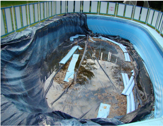
Figure 9. Abandoned swimming pool.