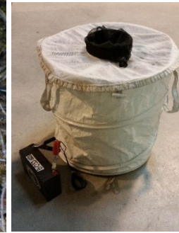
Figure 4. BG-Sentinel Trap

The BG-Sentinel Trap (Figure 4) mimics the motions and chemicals produced by a human host. The attractants are given off by various lures through a dispenser which releases a combination of lactic acid, octenol, ammonia, caproic acid and CO 2 ; substances found on human skin or released through respiration. These traps were specifically developed for attracting Aedes albopictus (see exotic species below). The trap consists of an easy-to-transport, collapsible white cylinder with white mesh covering the top. In the middle of the mesh cover is a black funnel through which a down draft is created by a 12V DC fan that causes mosquitoes in the vicinity of the opening to be drawn into a catch bag. The catch bag is located above the suction fan to avoid damage to specimens passing through the fan. The air then exits the trap through the mesh top. We plan on using a few of these traps as well as oviposition traps near large tire collection facilities in 2019 to monitor potential movement of Ae. albopictus in this area. In 2018, we did collect 1 adult female Ae. albopictus from a gravid trap in Manchester-by-the-Sea. Another single adult female was also collected in 2023 from a gravid trap in Nahant. No additional collections of these species were made to confirm if a resident population exists in our district.