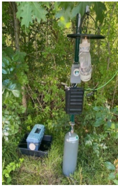
Figure 1. Historic CDC CO 2 /Light Trap station