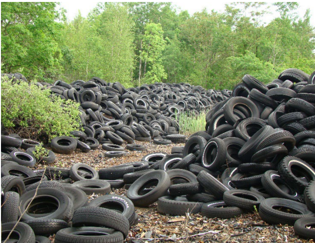
Figure 7. Discarded tire yard