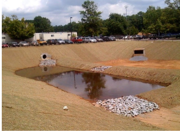
Figure 6. Retention pond.