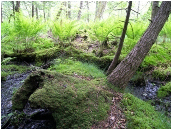
Figure 17. Red Maple/sphagnum and peat bog http://www.co.oswego.ny.us/info/news/2012/061112-1.html