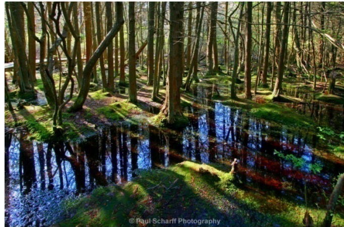
Figure 18. "Inside the Atlantic White Cedar Swamp Trail" http://www.paulscharffphotography.com/occ-insidetheatlanticwhiteceda.htm

These habitats are in relative abundance in northeast MA, although they exist more as isolated pockets and are difficult to access. During the winters, we will continue to narrow our search for Cs. melanura breeding to areas in the district. Our focus is to reduce the risk of EEE transmission in communities bordering NH, areas with historic EEE mosquito isolations and areas where Cs. melanura habitat is relatively abundant. The expectation is to make projections of what may happen in the following seasons and prepare for intervention.