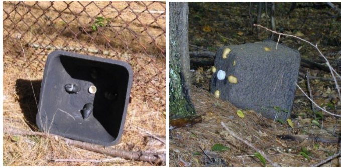
Figure 3. Resting Boxes (left back view; right front view)