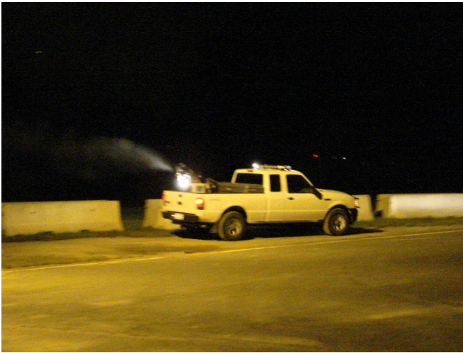
Figure 11. Truck spray at night