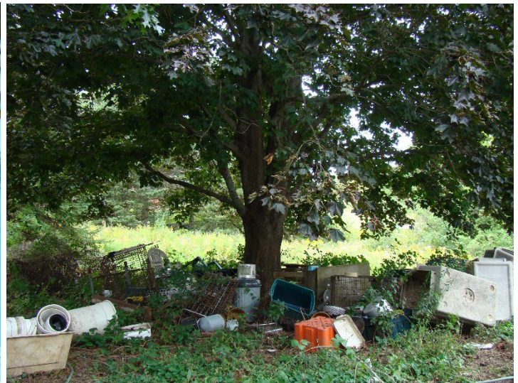
Figure 10. Abandoned home property with containers of all types collecting water.

In recent years we have received requests from Boards of Health to inspect abandoned properties (Figure 10) and we will continue this practice in 2026. During our routine activities, we will also inspect and report such properties to your Board. We will offer any support that may be appropriate to resolve mosquito problems related to such properties. With the support of the Boards of Health, we will implement the necessary control measures to mitigate any immediate mosquito problem associated with such properties.