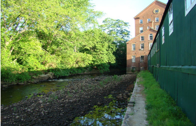
Figure 13. Powwow River (Amesbury) during drought.

As any large body of water dries, containers and tires that were dumped into these bodies (when full of water) now become exposed (Figure 14). Sometimes filled with polluted water, these now exposed man-made containers become ideal breeding sites for Culex . Exposed ground holes and depressions (either naturally occurring or artificial) can become filled with water in a sudden downpour and become instant breeding habitats for these species as well. Therefore, breeding areas for Culex mosquitoes are always in abundance, even in the middle of the worst drought.