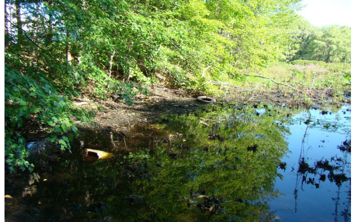
Figure 14. Drying pond in Newburyport is exposing debris and containers originally found under water.