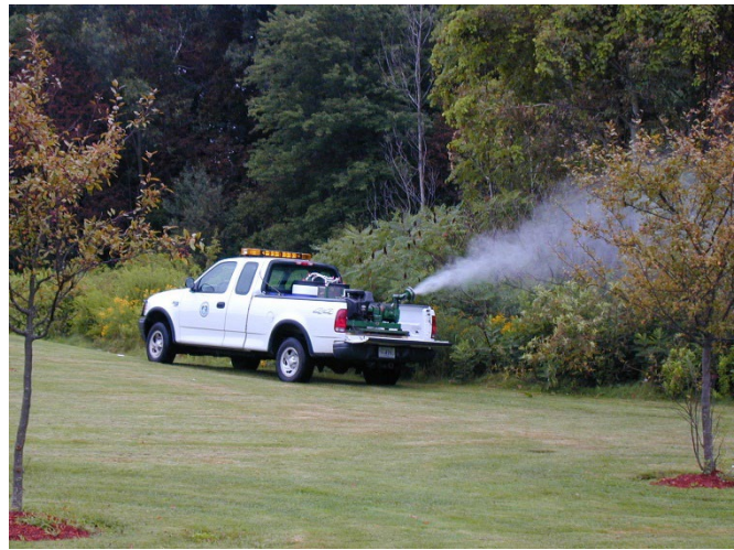
Figure 12. Truck applying barrier treatment at dusk.

Barrier Treatment: While ULV is a cost-effective procedure on a large scale, it only affects those mosquitoes active at the time of the application ; repeated applications are sometimes necessary to sustain population control. To reduce the need for repeated applications and provide more sustained relief from mosquitoes in high public use areas, the district may recommend a smaller scale “barrier spray treatment”. This application would be made to public use areas such as schools (applications to schools must be in compliance with MGL Ch. 85 and 333 CMR 14.08 : PROTECTION OF CHILDREN AND FAMILIES FROM HARMFUL PESTICIDES.), playgrounds, parks and athletic fields (Figure 12). A barrier spray may reduce mosquito presence for up to 3 weeks. The District strongly recommends member municipalities take advantage of this service when necessary.