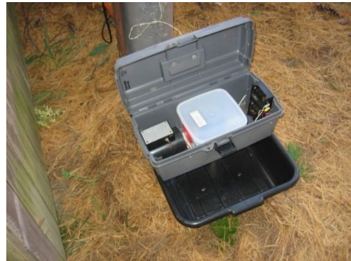
Figure 2. Reiter-Cummings Gravid Trap

The first of the two traps are the Light/CO 2 -baited CDC trap (Figure 1). To attract mosquitoes, a light is used along with carbon-dioxide gas released from a pressurized cylinder into a hose located at the top of the trap. As mosquitoes approach the gas released at the hose's opening, they are drawn inside by an internal fan, then blown into a container that hangs below. With this trap, nearly all mosquito species in a community are collected during that night. Because the trap stations are historically placed at the same locations every year, population trends can be predicted, studied, and compared between years, as well as during the current year.